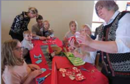
Goodhue County Historical Society Free Family Fun Day event attendance has nearly tripled in the last two years. Each month GCHS offers a free admission day with a theme and related activities. Here a volunteer is demonstrating how to make a Norwegian craft.