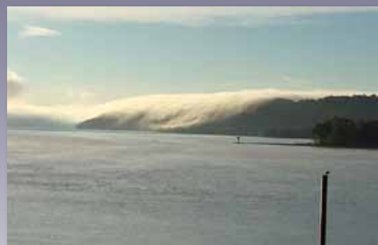
Fog rolling over Point No Point - Lake Pepin - Lake Pepin Legacy Alliance