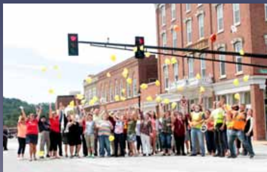
The Main Event - Photo courtesy of the Republican Eagle.