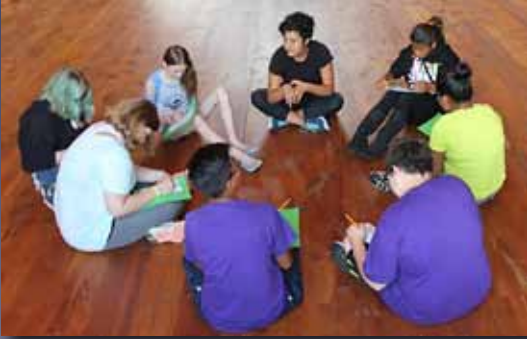
Sparkz Program - Playwright Discussions