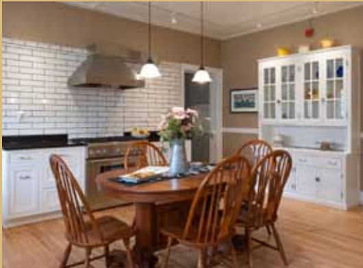
The Anderson Center Historic Residence Kitchen Renovation