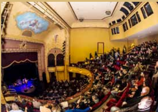
at Sheldon Theatre