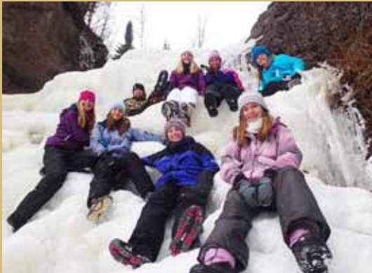
Red Wing Environmental Learning Center