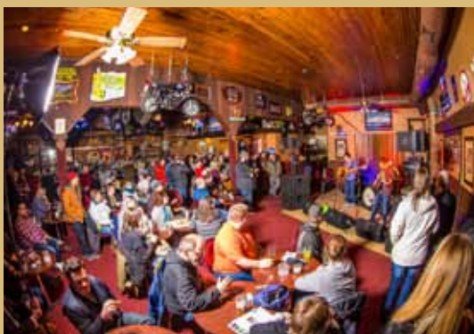
at Liberty's Lounge