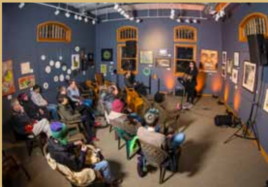
at Red Wing Arts