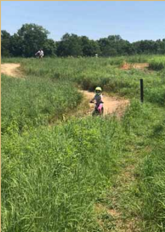
Red Wing Area Mountain Bike Organization