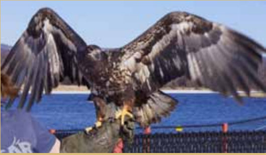
National Eagle Center